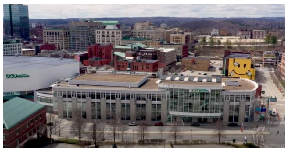
(Click Here to View)